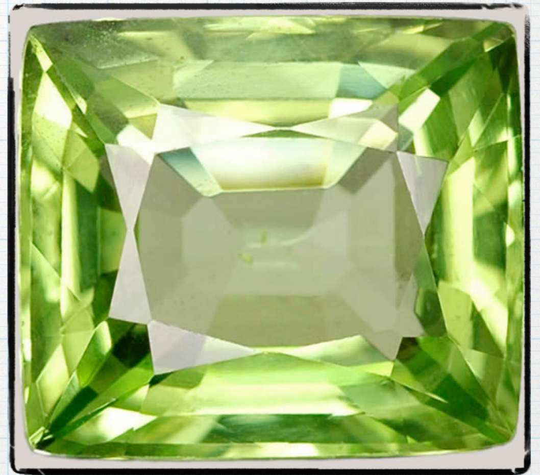
Cut peridot from gemselect.com Locality unspecified, probably San Carlos

A sharp, very gemmy, crystal from the OLD classic locality for gem peridot. Literally the oldest, perhaps dating back to the time of Cleopatra and the Egyptian Empires, anyhow. This island mine is now submerged underwater and inaccessible, gone forever. Specimens can still be obtained in old collections from time to time, and their combination of form, termination style, and olive color mark them as Egyptian as opposed to the modern Pakistani material. This is a superb thumbnail, large and gemmy, and complete all around. Formerly in the often-displayed gem thumbnails collection of Jim and Shelly Houran.